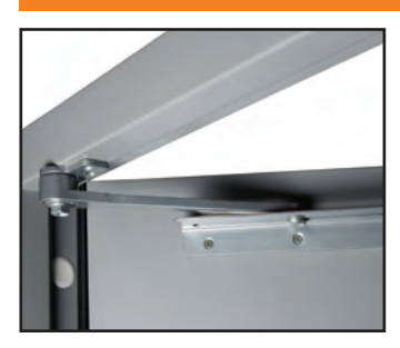
Door friction/limit stay, will restrict the doors opening to approximately 90°