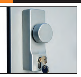
Exidor 302EC outside access device with Knob. (Exit Door Only)

Stainless steel butt hinges screwed to the frame and door -1<sup>1</sup>/<sub>2</sub> Pairs.