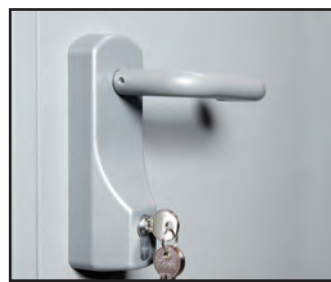
Exidor 322 lever operated outside access device. (Exit Door Only)