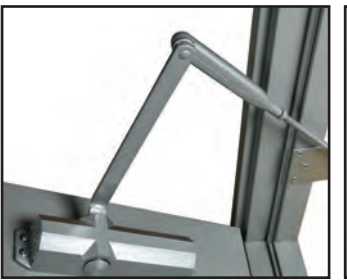
Arrone 6800 Door closer with adjustable closing speed/latch action.